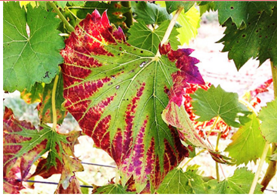
Figure 2. Magnesium (Mg) deficiency in Chambourcin. Note wedges of discoloration, starting from edges.