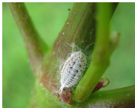
Figure 6. Grape mealybugs ( Pseudococcus maritimus ) on a grape shoot.