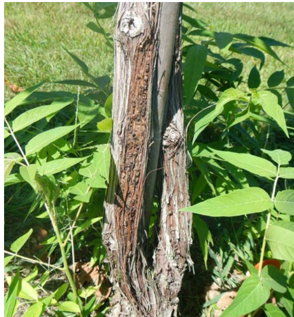
Figure 9. A series of small crown gall formed under the bark of Merlot.