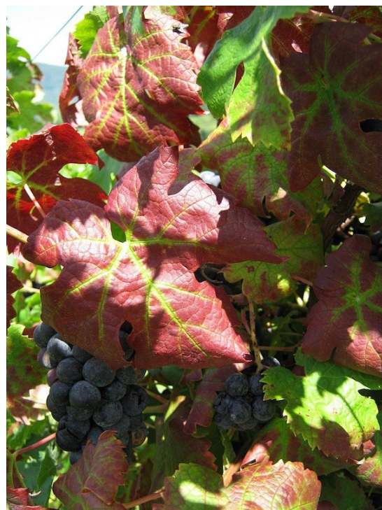
Figure 4. Grapevine leafroll disease symptoms on Cabernet Sauvignon. Note the reddish discoloration on interveinal areas of the leaf, but the veins stay green and the downward cupping or curling from the edges.

Grapevine red blotch disease is a recently recognized virus that has existed for a long time. As the name suggests, blotches of red pigment appear randomly on leaves of infected vines. It can be detected at any stage of vine growth in any part of a vine. It can easily be mistaken for potassium deficiency or leaf roll virus, especially when leaves cup or roll (Figure 7). Because of the recent recognition of the virus, there are ongoing efforts to understand how (or if) it spreads in vineyards. It is known that the red blotch virus can be disseminated through propagation and grafting with infected materials.