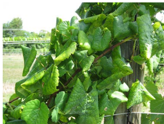
Figure 5. Grapevine leafroll disease symptoms on Chardonnay. Note the interveinal area turning pale green while the veins turn yellowish and the downward cupping or curling from the edges.