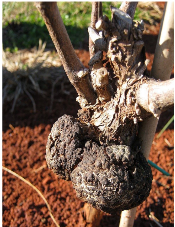
Figure 8. Crown gall symptom at the graft union.