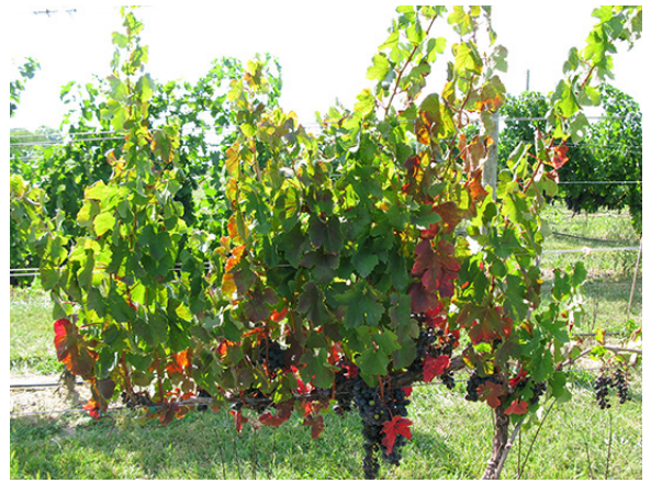
Figure 10. Red foliar discoloration caused by crown gall. Note the gall formation on the trunk.

Cooperating Agencies: Rutgers, The State University of New Jersey, U.S. Department of Agriculture, and County Boards of Chosen Freeholders. Rutgers Cooperative Extension, a unit of the Rutgers New Jersey Agricultural Experiment Station, is an equal opportunity program provider and employer.