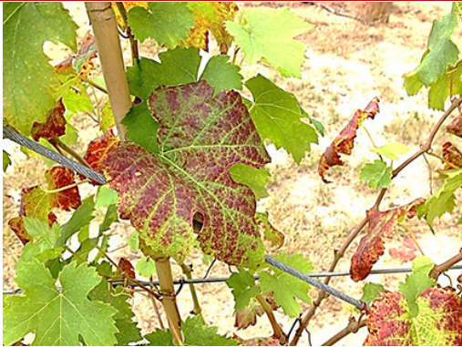
Figure 1. Potassium (K) deficiency in Cabernet Franc. Note leaves turning red in between the vein.