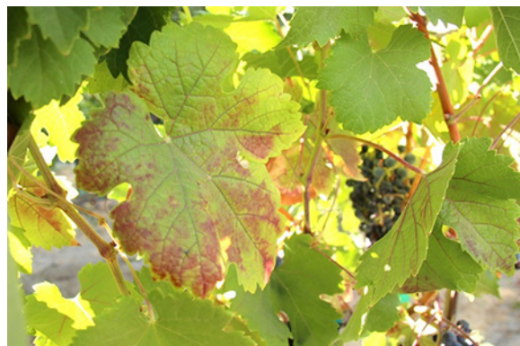
Figure 7. Grapevine red blotch disease symptoms on Merlot. Note red pigment appearing randomly on leaf. Reddening from edges can be mistaken for K deficiency and rolling or curling at edge can be mistaken for leaf roll virus symptoms.

It can be very difficult to accurately identify the cause of red leaves. Virus testing (for leafroll, red blotch, and others) is expensive, hence the first recommendation in an identification flowchart is to inspect trunks for integrity, and then perform petiole analysis (Figure 11). If trunk diseases and nutrient deficiencies are ruled out, samples should be sent for virus testing. Below is a list of grapevine virus testing laboratories. Lab testing pricing varies, so make sure to contact several companies for cost comparison.